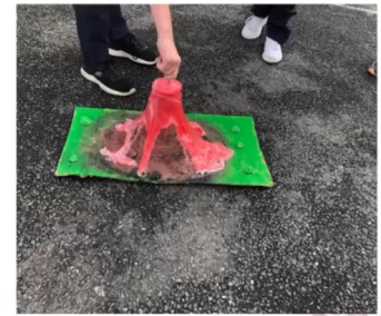
6th Class Volcanic Eruptions